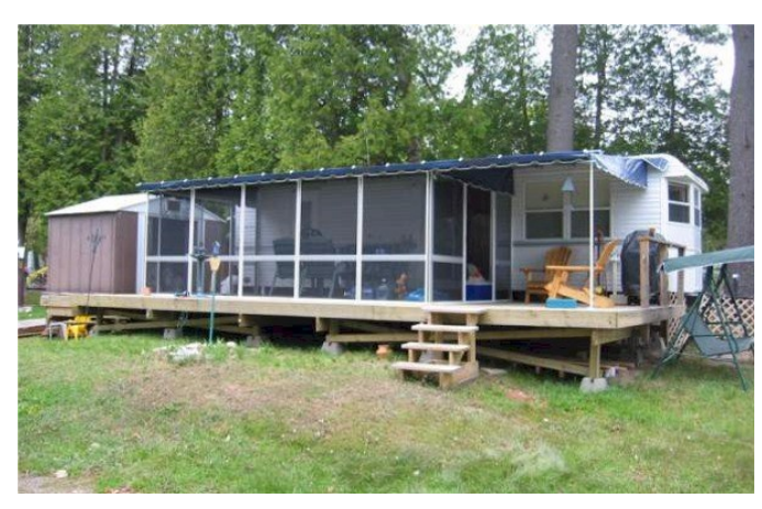
You can design your screen room to be any combination of enclosed screen room with open canopy (on right or left hand side). Please call us for pricing on the one you would like to build!