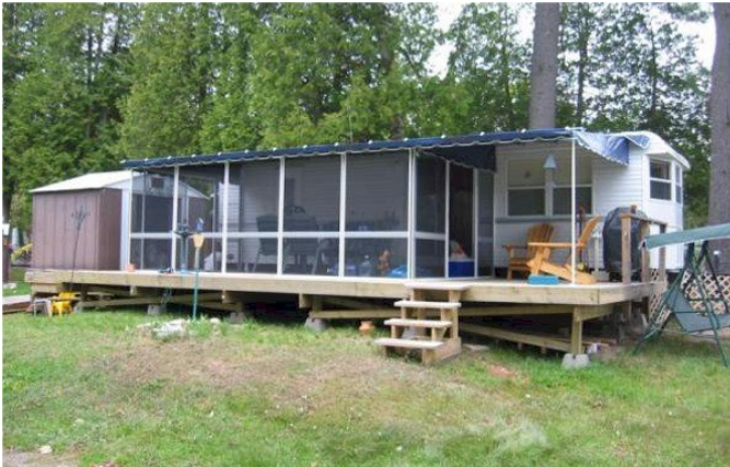
You can design your screen room to be any combination of enclosed screen room with open canopy (on right or left hand side). Please call us for pricing on the one you would like to build!