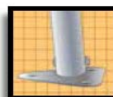
Steel foot plates

Actual frame dimensions are 14 ft. W x 44 ft. L x 16 ft. H