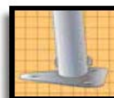
Steel foot plates

Actual frame dimensions are 14 ft. W x 40 ft. L x 16 ft. H