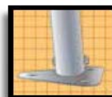
Steel foot plates

Actual frame dimensions are 14 ft. W x 24 ft. L x 12 ft. H