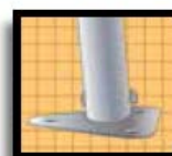
Steel foot plates

Actual frame dimensions are 14 ft. W x 36 ft. L x 16 ft. H