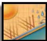
UV treated fabric