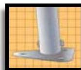
Steel foot plates

Actual frame dimensions are 10 ft. 4 in. W x 12 ft. L x 8 ft. H