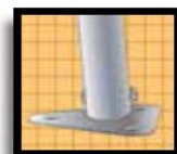
Steel foot plates

Actual frame dimensions are 14 ft. W x 28 ft. L x 12 ft. H