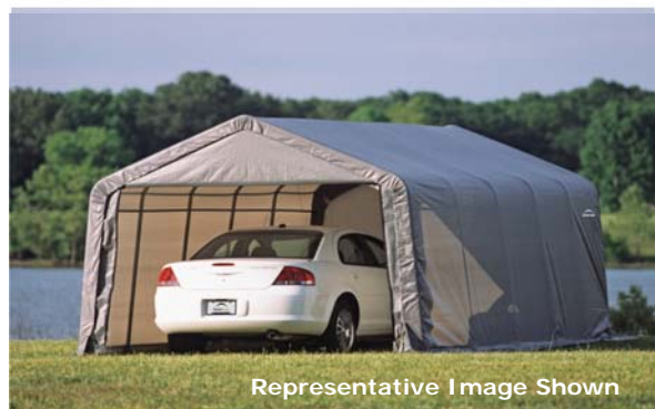
Representative Image Shown

For Information or to order CALL (800) 922-4760