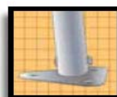
Steel foot plates

Actual frame dimensions are 11 ft. W x 12 ft. L x 10 ft. H