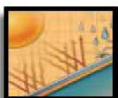
UV treated fabric