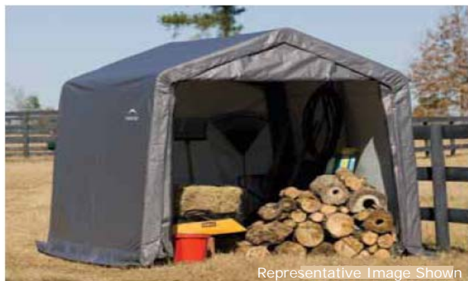
Representative Image Shown

For Information or to order CALL (800) 922-4760