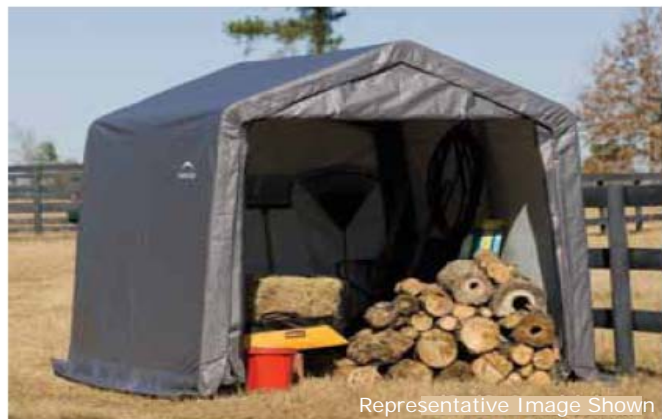
Representative Image Shown

For Information or to order CALL (800) 922-4760