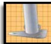
Steel foot plates

Actual frame dimensions are 10 ft. W x 16 ft. L x 8 ft. H