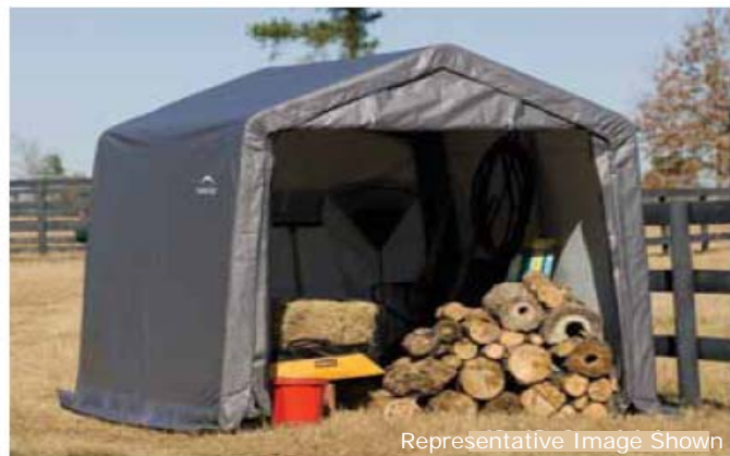
Representative Image Shown

For Information or to order CALL (800) 922-4760