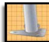
Steel foot plates

Actual frame dimensions are 12 ft. 5 in. W x 24 ft. L x 8 ft. 5 in. H