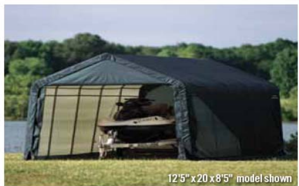
12'5" x 20' x 8'5" model shown

For Information or to order CALL (800) 922-4760