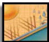
UV treated fabric