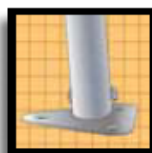
Steel foot plates

Actual frame dimensions are 8 ft. 4 in. W x 16 ft. L x 7 ft. 6 in. H