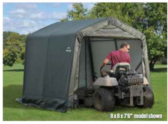
8 x 8 x 7'6" model shown

For Information or to order CALL (800) 922-4760