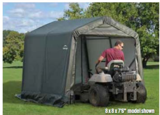
8 x 8 x 7'6" model shown

For Information or to order CALL (800) 922-4760