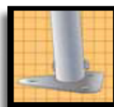
Steel foot plates

Actual frame dimensions are 8 ft. 4 in. W x 8 ft. L x 7 ft. 6 in. H