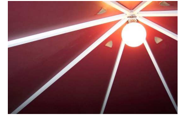
(light not included).