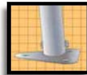
Steel foot plates

Actual frame dimensions are 10 ft. 4 in. W x 8 ft. L x 8 ft. H