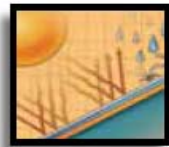
UV treated fabric