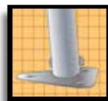
Steel foot plates

Actual frame dimensions are 8 ft. 4 in. W x 12 ft. L x 8 ft. H