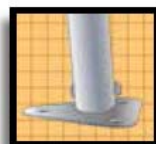
Steel foot plates

Actual frame dimensions are 8 ft. 4 in. W x 8 ft. L x 8 ft. H