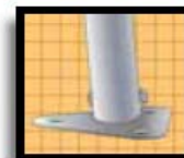
Steel foot plates

Actual frame dimensions are 10 ft. W x 8 ft. L x 8 ft. H