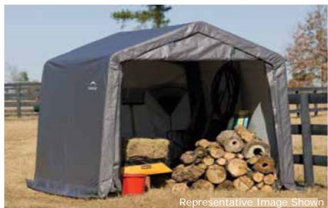
Representative Image Shown

For Information or to order CALL (800) 922-4760