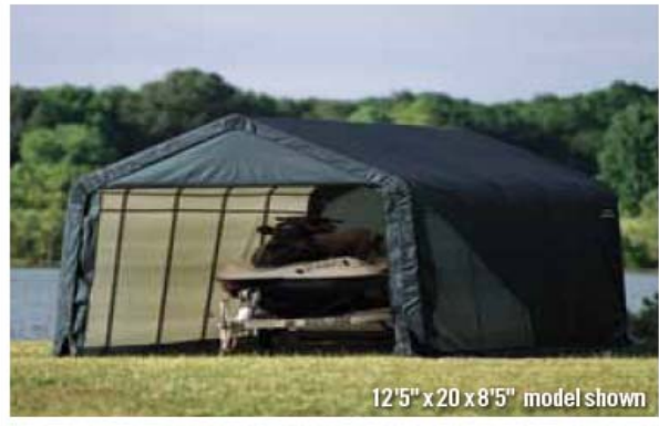
12'5" x 20' x 8'5" model shown

For Information or to order CALL (800) 922-4760