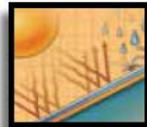
UV treated fabric