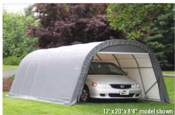
12' x 20' x 8' 4" model shown

For Information or to order CALL (800) 922-4760