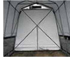
Fully Supported Back Wall