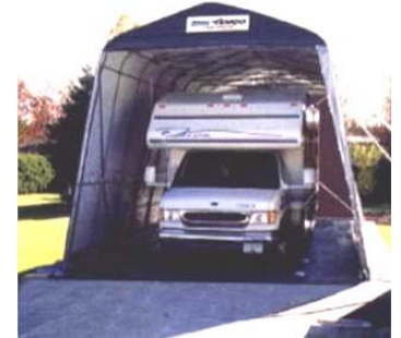
Ground tarp protects from ground moisture