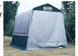
Front Door Closed