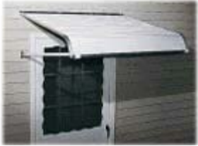
2500 without Side wings

Step 1: Use chart below, choose the PROJECTION that best suits your needs. If you are mounting over an out-swinging door, choose at least a Model 7.